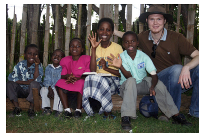
At Castleman Orphanage, Kenya in 2008 with A Better World

Source: WHO World Health Statistics 2006